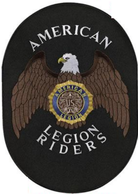
3-Line Back Patch

The American Legion Riders use a one-piece-patch design. The Emblem Sales website sells two separate patch designs (pictured below).