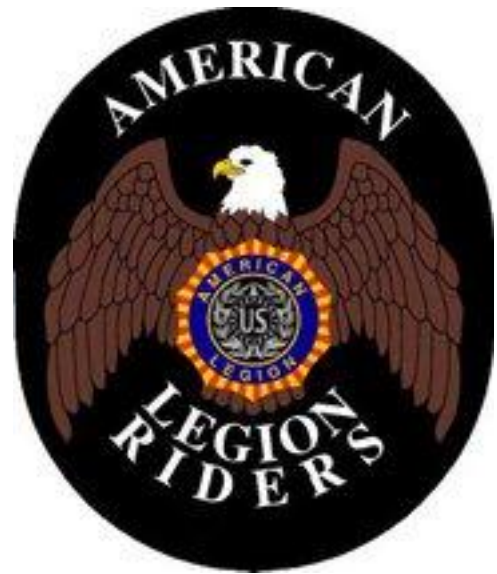
1-Line Back Patch

The 3-line back patch provides a single line of text at the top (above “AMERICAN”) and two lines of text at the bottom (below “LEGION RIDERS”). These lines are available for embroidering through Emblem Sales based on the wording provided when ordering a patch (see examples below for Nebraska wording protocol). For the 1-line back patch a single line of text can be embroidered at the bottom (below “LEGION RIDERS”). Upper and lower rockers may be added to the back of a rider’s vest. However, it is important that any/all rockers NOT TOUCH the back patch to avoid violation of ALR patch trademark laws. To avoid all appearances of a three-piece-patch and not violate ALR patch trademark laws, rockers should be attached with a ¼” gap between the rocker and back patch edges.